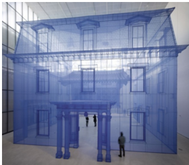
Do Ho Suh Home within a home within a home within a home. 2013

Project Title: HUMAN SCALE VS CITY SCALE